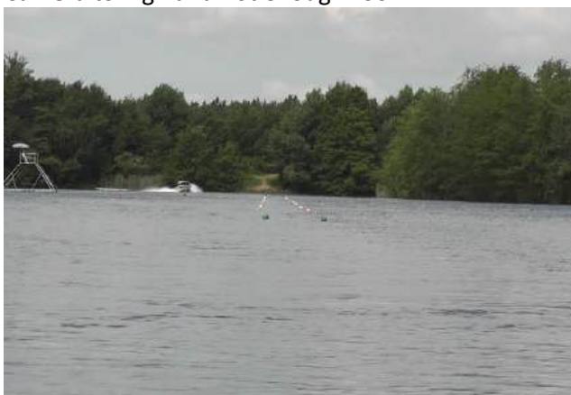
Not enough zoom