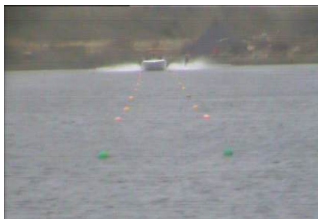
Not enough zoom and image too grainy