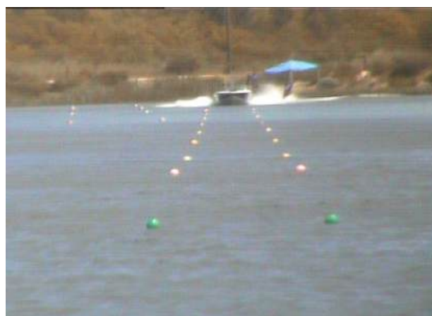
Not enough zoom and image too grainy