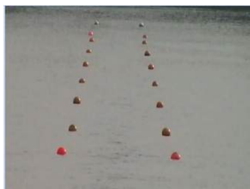
Edges of the monitor not visible camera too high