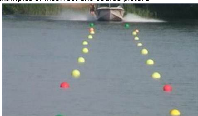
Edges of the monitor not visible